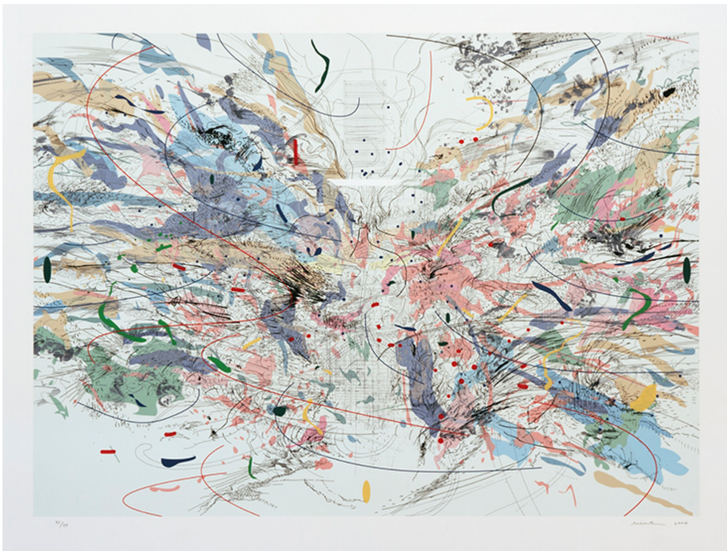
Entropia (review) / Julie Mehretu / 2004 / Lithograph, screenprint on paper