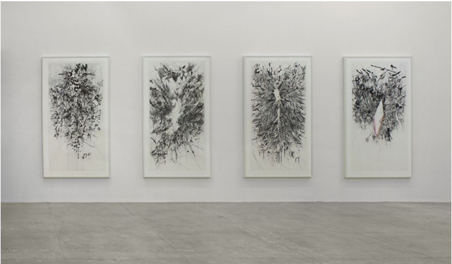
Myriads, Only By Dark (unfolded body map, mathematics of droves, indigine, origin) / 2014

Like many larger than life voices, Mehretu has had her detractors over the years, facing accusations of being macho, pompous and even a supporter of US imperialism. But she has remained steadfast and undeterred, earning the MacArthur “Genius” Fellowship in 2005 and the US Department of State Medal of Arts in 2015, while her paintings now reach into the millions at auction.