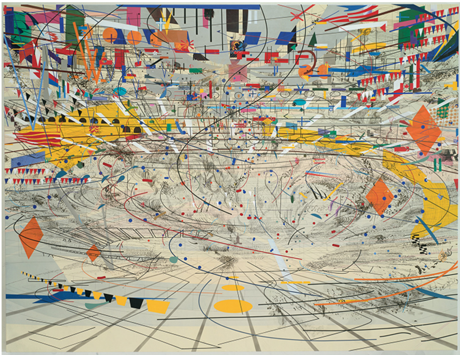
Stadia II / 2004 / Ink & acrylic on canvas

locations, Mehretu admitted in an interview in 2003 that tracing her own lineage was also an important point of departure from which she could open out into wider cultural references, saying, “My fascination was with the numerous conflicting stories, histories and disparate cultures that, through time and place, came together to make me...”