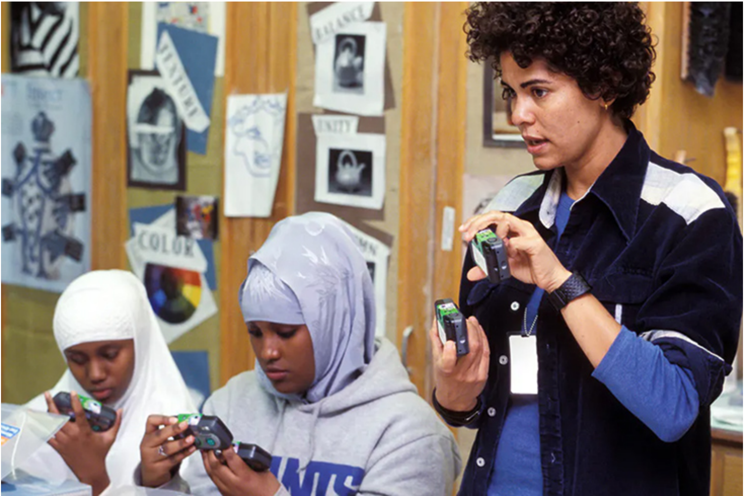
Julie Mehretu / 2002

Setting out to become an artist, Mehretu initially chose to study fine art at the Universite Cheikh Anta Diop, Dakar, Senegal, before receiving her BA in Art from Kalamazoo College in Michigan. At the start of an MFA with the Rhode Island School of Design in New York in the mid-1990s she was working somewhat half-heartedly in an Abstract Expressionist style, as she explains, “When I started my MFA, I was making big, abstract oil paintings that looked gestural and expressionistic, even though I wasn’t interested in them looking like that.”