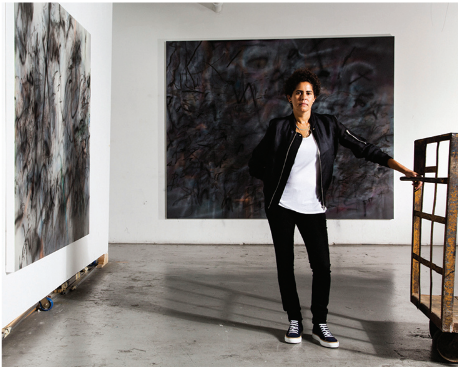
Artist Julie Mehretu poses for a portrait in her studio on Thursday, August 11, 2016 in NYC

“I am looking for that space where you can’t have that singular, particular experience. It’s about what is undefined, unstable – and for me, that’s important politically.”