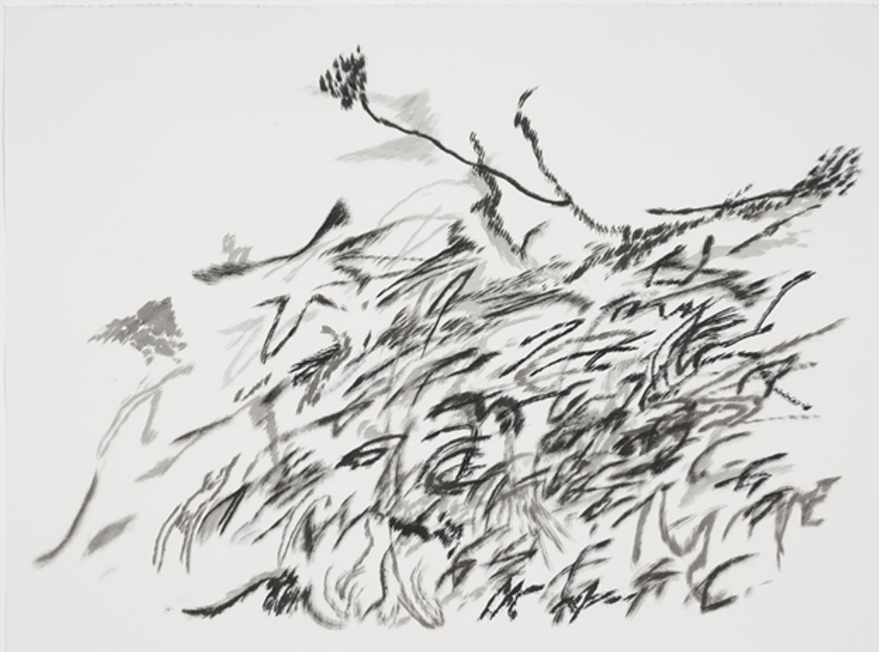
Untitled (7) / 2014 / Ink on paper