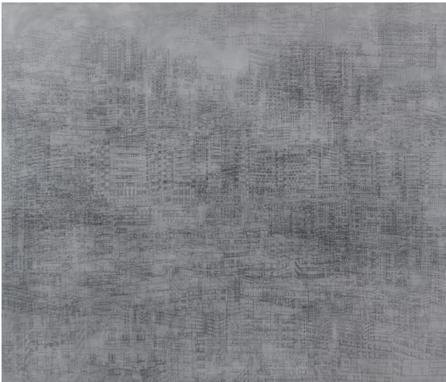
Aleppo / Julie Mehretu / 2014 / Ink and acrylic on canvas

Today Mehretu continues to live and work in New York, but she has also established a second studio in Berlin which she visits frequently; perhaps this is no surprise for a city imbued with the same fragmentary dislocation, loss and reinvention as her works of art. She paid homage to the German capital recently with the subtle, ghostly series Berliner Platze , 2008-9, a melancholic memoriam of all the 19 th century buildings destroyed by the Second World War.